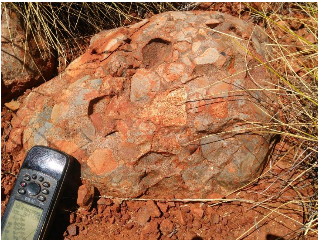
Figure 4. Mapped conglomerate within E47/3522