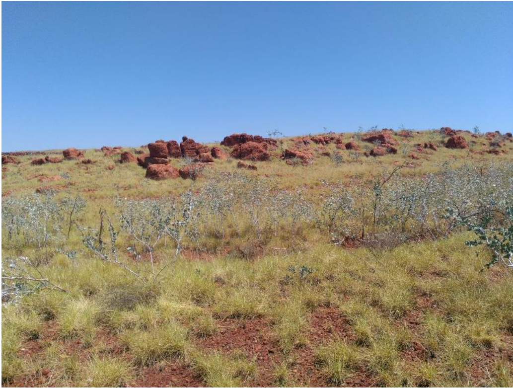
Figure 3. Conglomerate outcrops within the northern portion of E47/3522