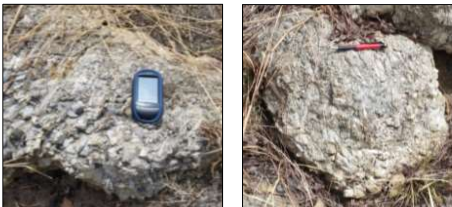
"Crowded" spodumene rock at Goulamina

This first phase work program will provide the necessary geological and grade data to, if appropriate, estimate an initial JORC compliant resource at Goulamina, and is intended to provide inputs for a Scoping Study which will define the parameters of subsequent phases of detailed work on the deposit. These programmes are expected to be completed before year-end.